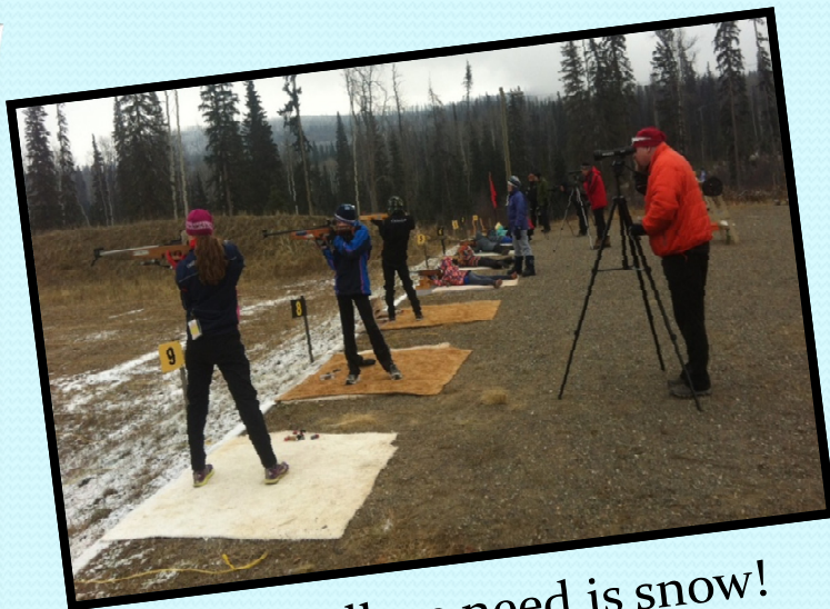
Now all we need is snow!