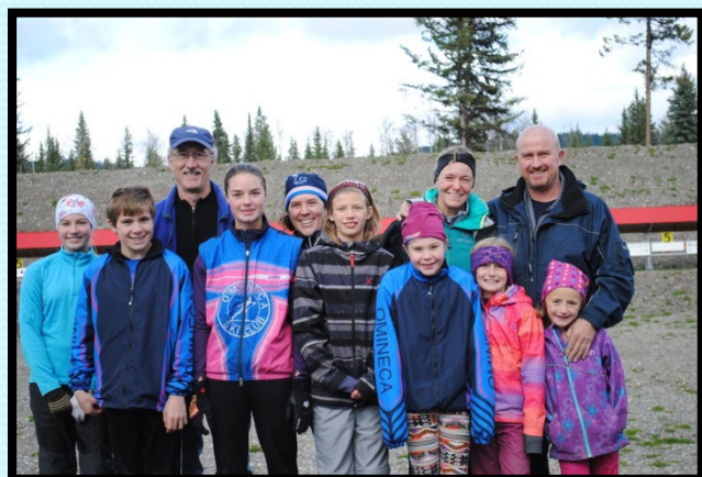
All the OSC racers at Otway. Go team Omineca!!