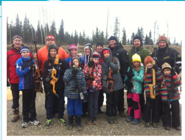
Look how we've grown.